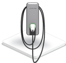
Smart EV Charger