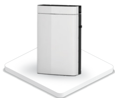
Energy Storage Battery