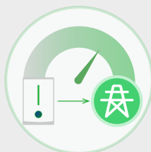
Export Control Function