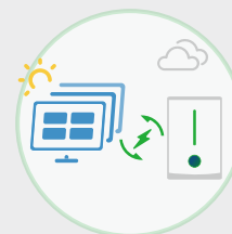
Compatible with High-current PV Modules